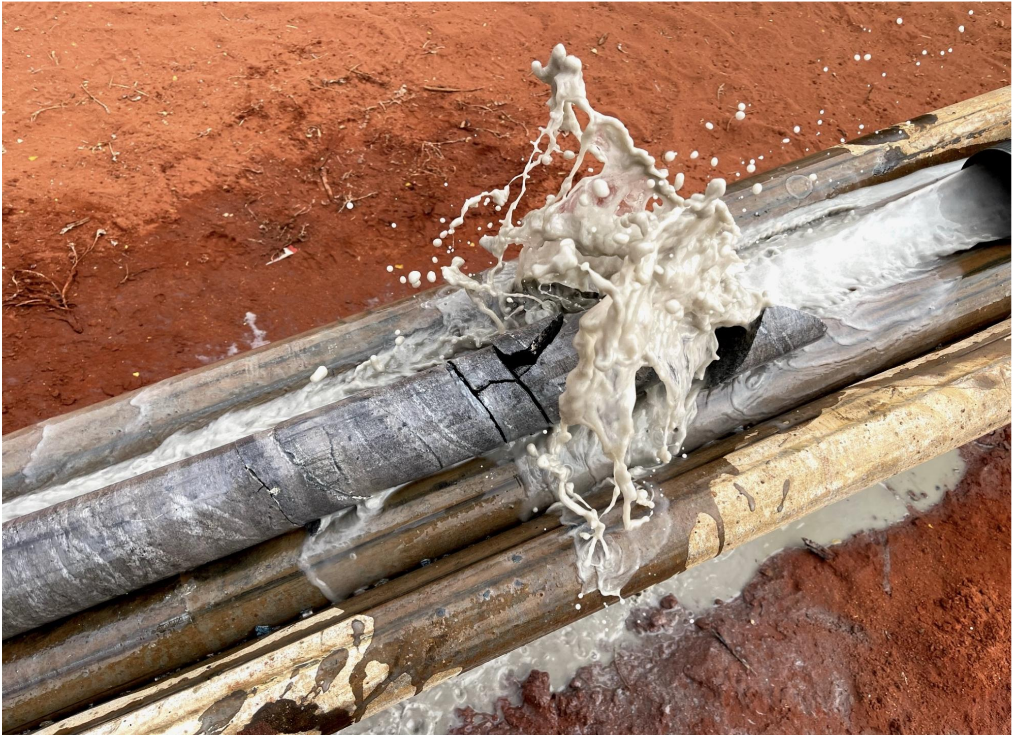
Figure 1: Diamond core being pumped out of the drilling rods at Aurora Tank (May 2023)